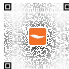
Repair registration Maytronics

▶ Download repair registration Maytronics