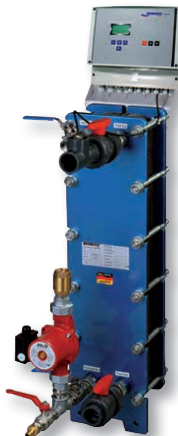
Plate heat exchanger “TSC 910” as a compact system

Due to their uncompromising high-quality design BEHNCKE plate heat exchangers are also excellently suited—in addition to their use in private swimming pools—for applications in the public or industrial sectors. For these very specific requirements, frames, plates and seals are also available in various material finishes, so that, depending on the fluids